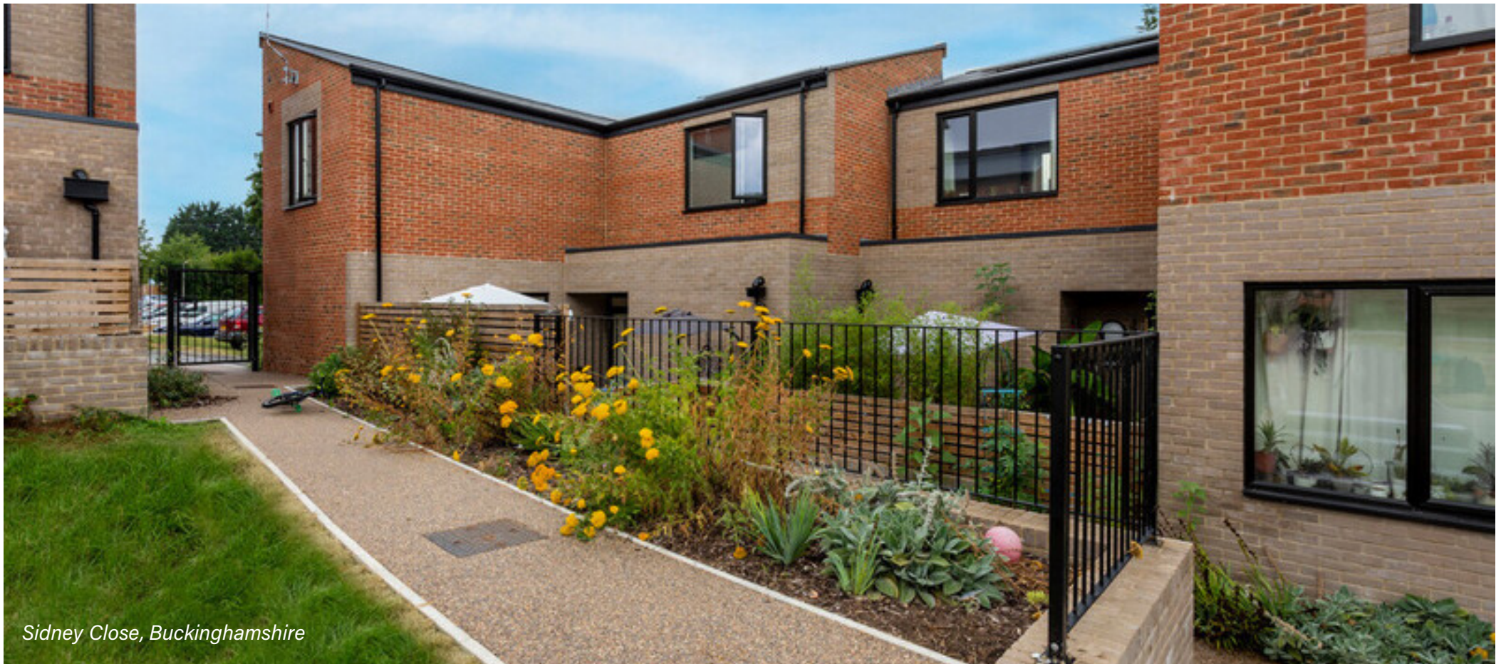
Sidney Close, Buckinghamshire